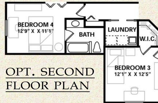
OPT. SECOND FLOOR PLAN

SQUARE FOOTAGE FIRST FLOOR: 1,585 SQ. FT. SECOND FLOOR: 1,640 SQ. FT. TOTAL: 3,225 SQ. FT.