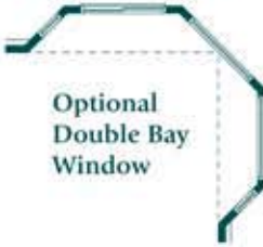
Optional Double Bay Window