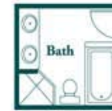
Optional Master Bath