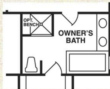
OPTIONAL OWNER'S BATH PLAN

SQUARE FOOTAGE FIRST FLOOR: 1,099 SQ. FT. SECOND FLOOR: 1,184 SQ. FT. TOTAL: 2,283 SQ. FT.