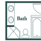
Optional Master Bath