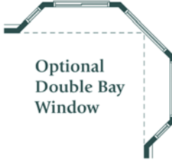
Optional Double Bay Window