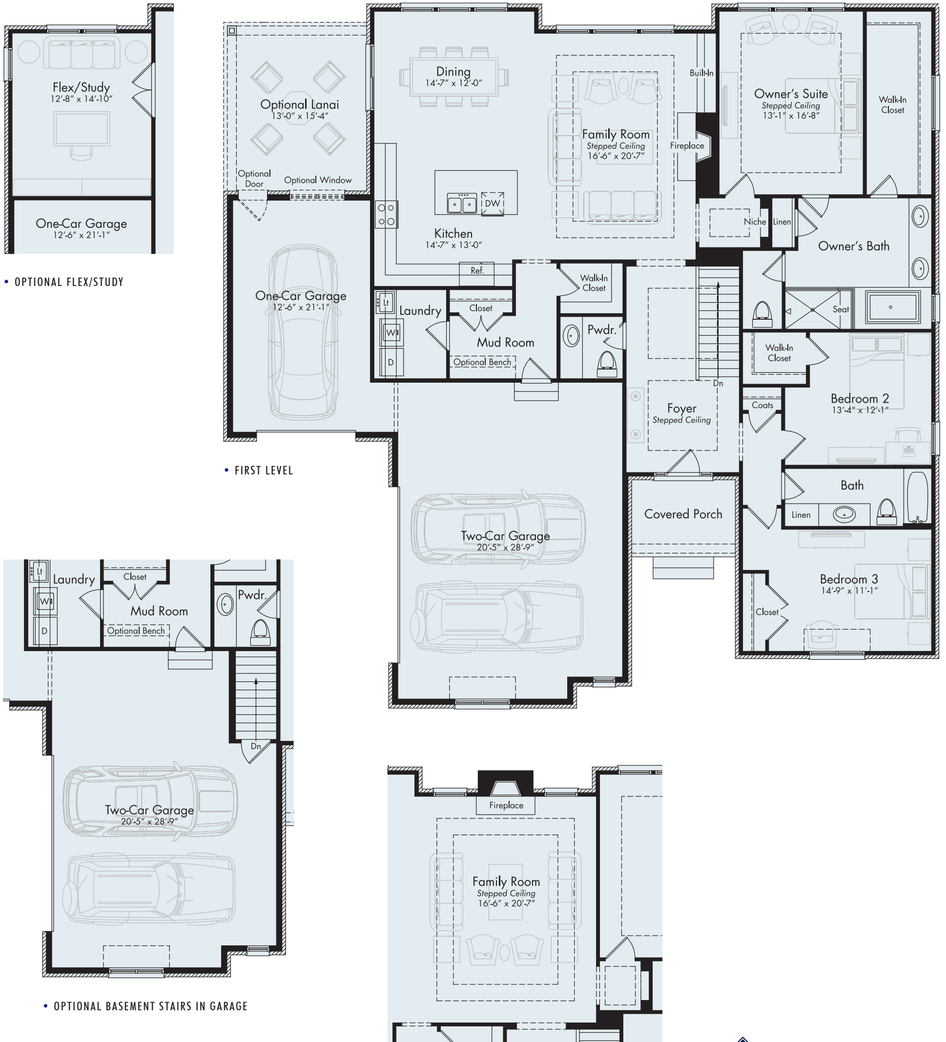
• OPTIONAL FLEX/STUDY

When your day is winding down, the owner's suite, with a stepped ceiling, is waiting for you. Take a soak in the tub of the secluded owner's bath. Have a lot of clothes? The long extended walk-in closet will be able to handle that. There is also room for your kids or guests in the two additional bedrooms, which share a full bath.