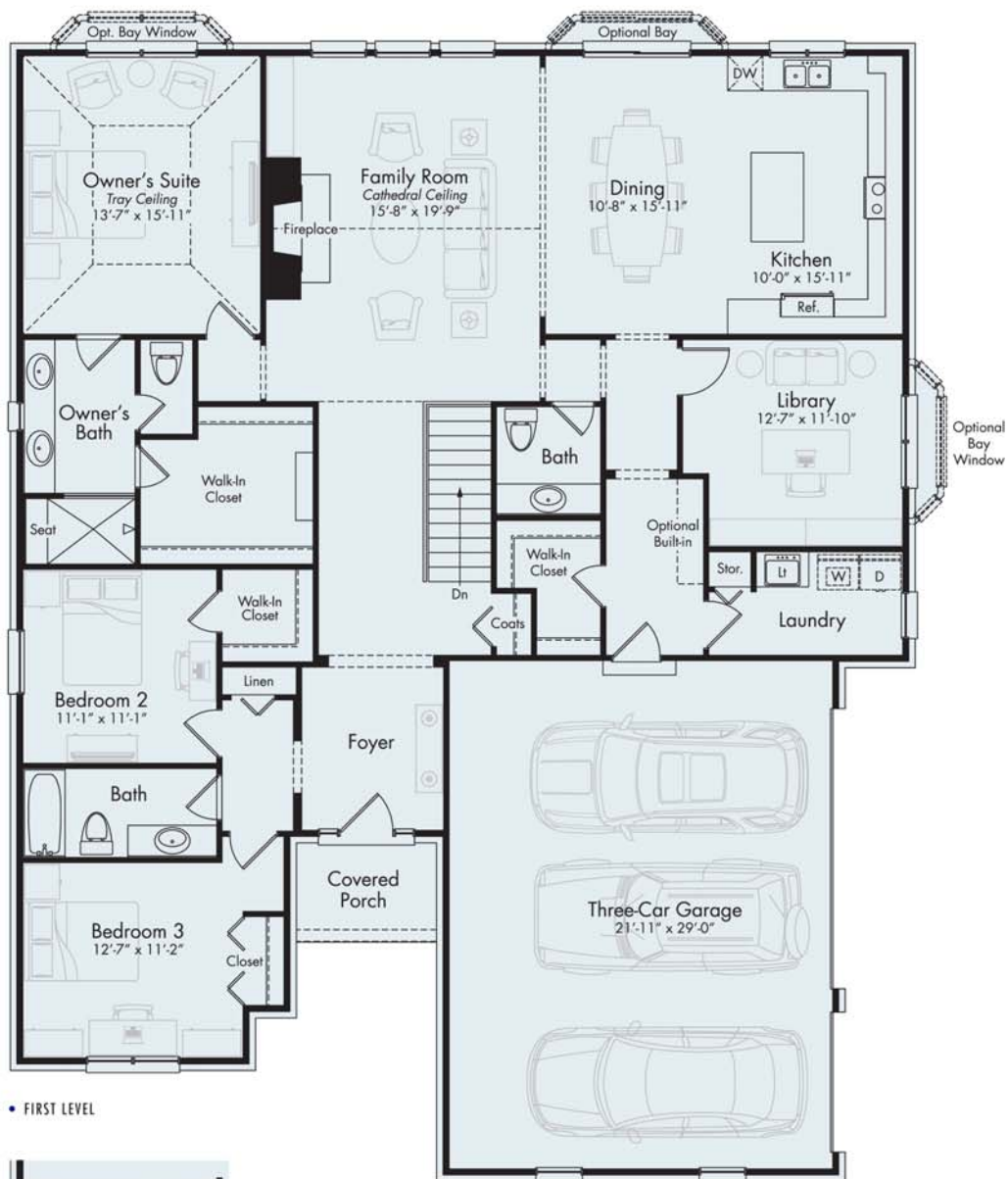
• FIRST LEVEL

The three bedrooms will give you the accommodations needed for an expanding family or a place for visiting guests to stay. The owner's suite showcases a tray ceiling, a spacious bath, and a large walk-in closet. The other two bedrooms share a full bath that can be modified to a Jack-n-Jill bath with direct access from both bedrooms. There is smart space for everything. The mudroom with optional built-ins connects the three-car attached garage, the first floor laundry room with storage, and a large walk-in closet.