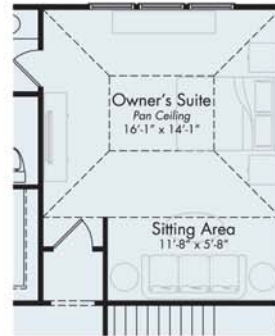
• OPTIONAL SITTING ROOM