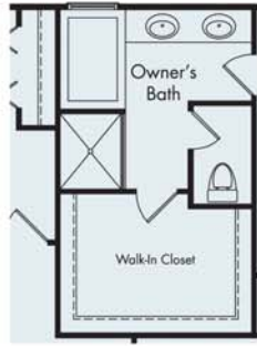
• OPTIONAL OWNER'S BATH

The Grand Galaxy has space for everyone in the family. With four bedrooms, each member of the family has their own enclave. The owner's suite features a pan ceiling, his and her walk-in closets, and an owner's bath with dual vanity and optional soaking tub. Want to add extra space to the owner's suite? An optional sitting area is available.