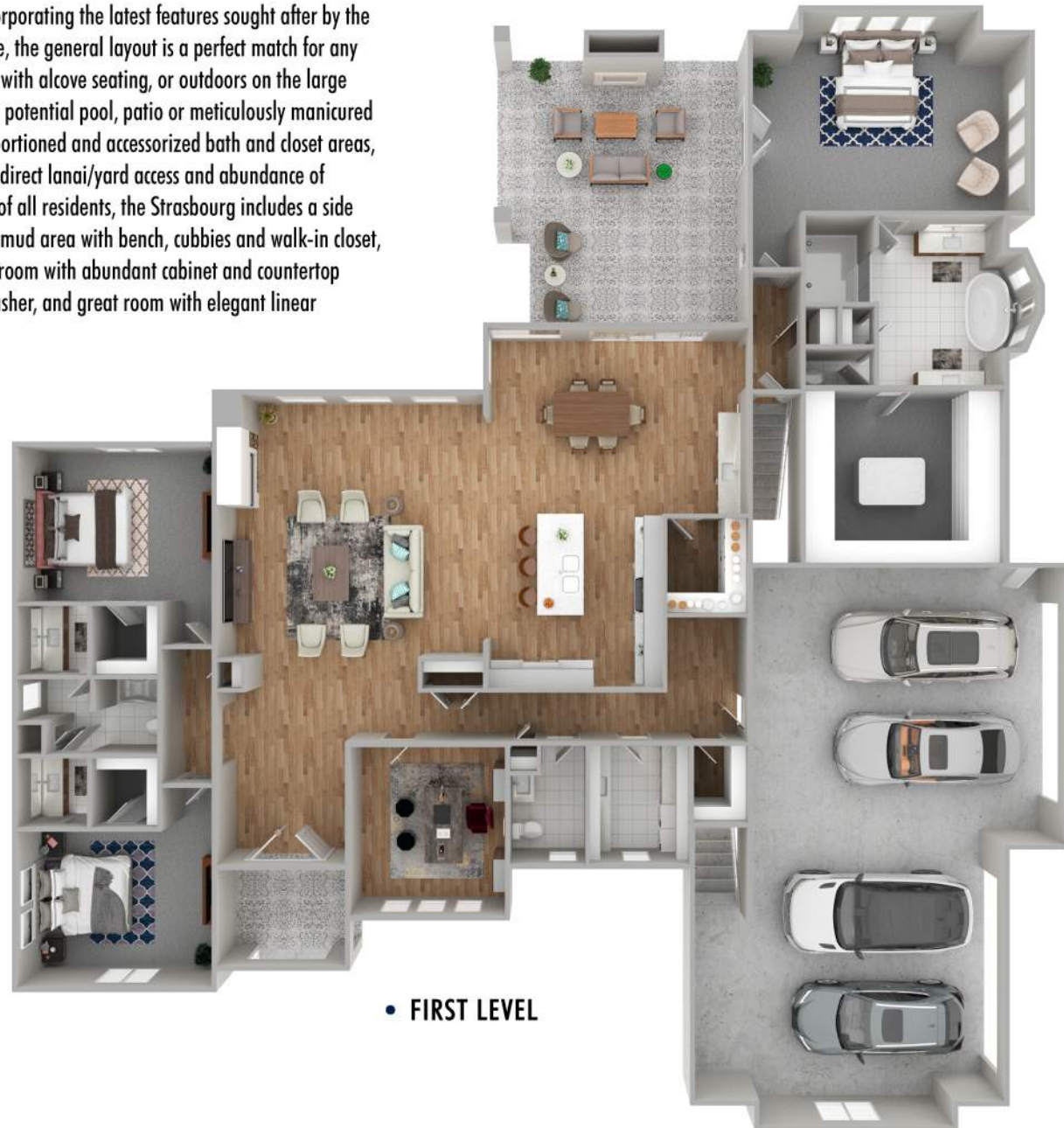
• FIRST LEVEL

The Strasbourg II was specifically designed for modern living, incorporating the latest features sought after by the most discerning homeowners. It's all in the details. At first glance, the general layout is a perfect match for any family looking to entertain, either indoors in the spacious kitchen with alcove seating, or outdoors on the large covered lanai projecting into the rear yard perfectly for access to a potential pool, patio or meticulously manicured softscape. As a split ranch, the Master Suite with generously proportioned and accessorized bath and closet areas, is by definition separated from the other bedrooms; however, the direct lanai/yard access and abundance of natural light are far from isolating. Considering the convenience of all residents, the Strasbourg includes a side covered porch, basement access from the 4 car garage, a spacious mud area with bench, cubbies and walk-in closet, separate vanities and walk-in closet for each bedroom, a laundry room with abundant cabinet and countertop space, large walk-in pantry, oversized island with sink and dishwasher, and great room with elegant linear fireplace and accent tiles or stone veneer.