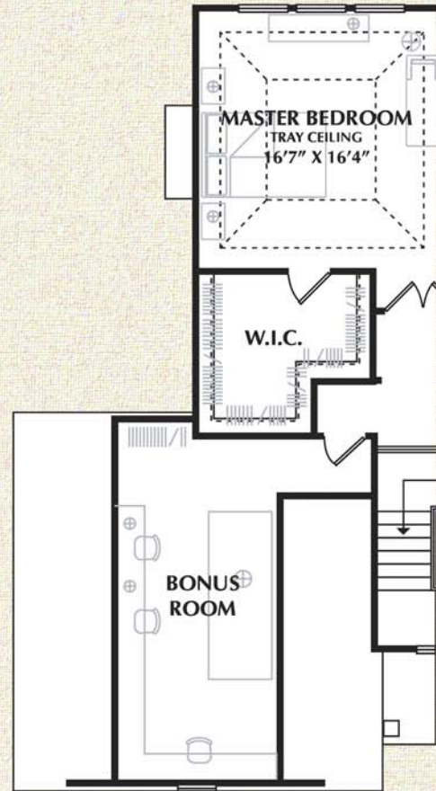
OPTIONAL BONUS ROOM