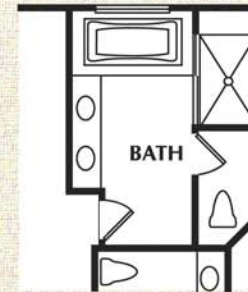
OPTIONAL MASTER BATH

ARTIST RENDERINGS AND FLOOR PLANS ARE FOR ILLUSTRATION PURPOSES ONLY AND ARE SUBJECT TO CHANGE. THESE PLANS ARE NOT TO BE REPRODUCED, CHANGED, OR COPIED IN ANY FORM OR MANNER WHATSOEVER. WE RESERVE THE RIGHT TO MAKE CHANGES IN DESIGN, FEATURES AND OPTIONS WITHOUT NOTICE OR OBLIGATION. FLOOR PLAN DIMENSIONS AND SQUARE FOOTAGES ARE APPROXIMATE. NOTE: PLANS WILL VARY PER ELEVATION.