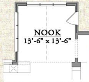
OPT. NOOK FLOOR PLAN