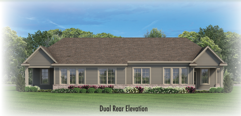
Dual Rear Elevation

MJC's new cutting-edge homes display a beautiful sense of traditional style and proportion. Each home includes professional landscaping with sod yards and a sprinkler system. Now you can enjoy lock-and-leave freedom with landscape, lawn and snow removal included.