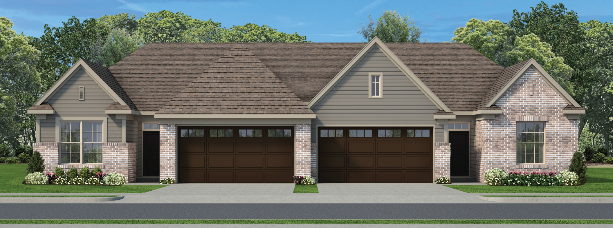
Dual Front Elevation