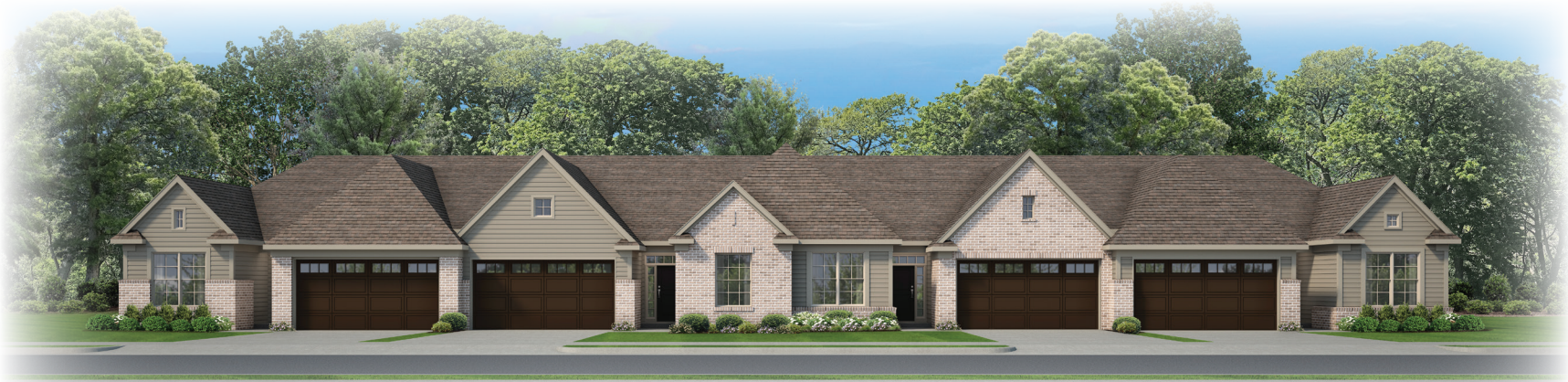
Quad Front Elevation