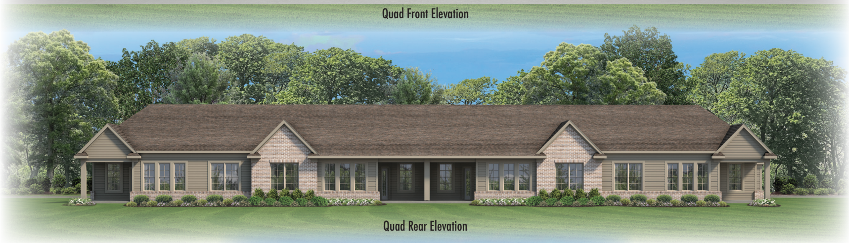
Quad Rear Elevation

MJC's new cutting-edge homes display a beautiful sense of traditional style and proportion. Each home includes professional landscaping with sod yards and a sprinkler system. Now you can enjoy lock-and-leave freedom with landscape, lawn and snow removal included.