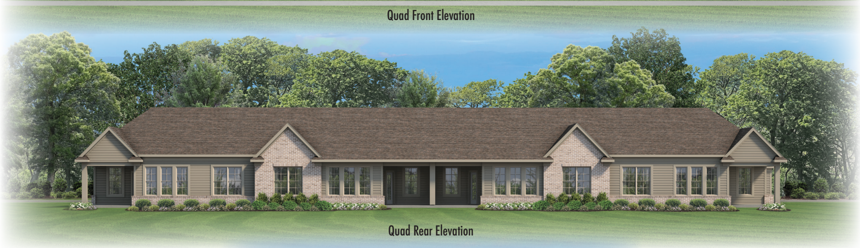
Quad Rear Elevation

MJC's new cutting-edge homes display a beautiful sense of traditional style and proportion. Each home includes professional landscaping with sod yards and a sprinkler system. Now you can enjoy lock-and-leave freedom with landscape, lawn and snow removal included.